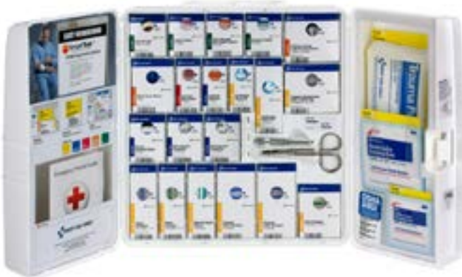
FIRST-1000-FAE-0103 Pictured Above.

JIS Consignment Customers are eligible to participate in a replenishment program for their standard SmartCompliance First Aid Cabinet.